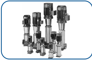
HIGH PRESURE PUMP