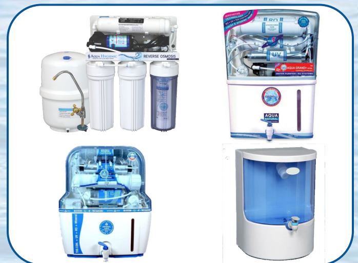
DOMESTIC - RO