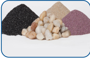
CARBON & MEDIA