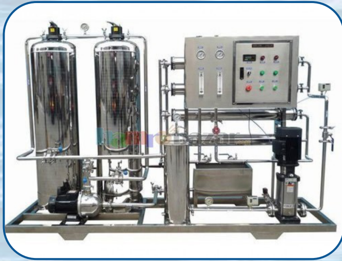
STAINLESS STEEL RO