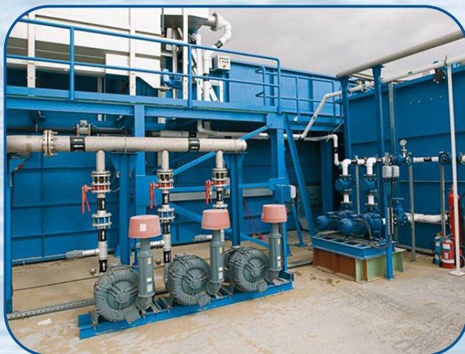
WASTE WATER TREATMENT PLANT