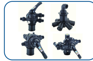
MULTI PORT VALVE