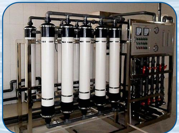
ULTRA FILTRATION SYSTEM