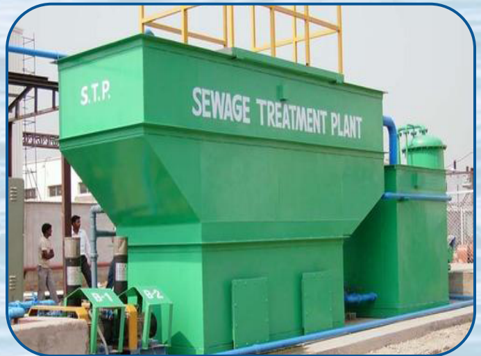
SEWAGE TREATMENTS PLANT